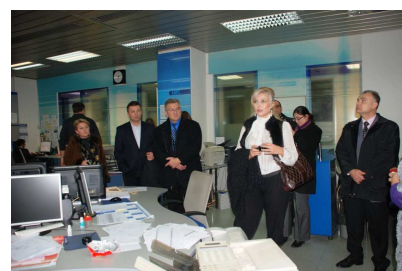
Visit/guided tour of the Croatian Radio and Television

At the end of the first working day, the Croatian Radio and Television organized a visit/guided tour of its headquarters. During the tour, the participants had a chance to see a typical working day in this institution, its studios and facilities, as well as the equipment used.