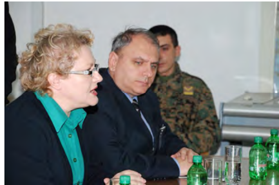
Visit to Regional Transition Centre in Rajlovac

organized the visit to one of the regional transition centres - the one positioned in Rajlovac near Sarajevo.