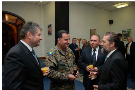
Army Club - Welcome Reception

the previous WG1 Workshop that was held in Ohrid, the former Yugoslav Republic of Macedonia 1 . One of the major requests there was the review of activities that were provided by IOM as an external and non-institutional solution, together with the comparative analysis of western career transition support systems.