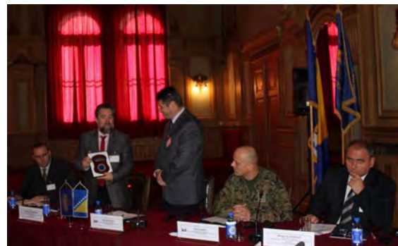
Workshop Conclusion Session - Presentation of Memorabilia