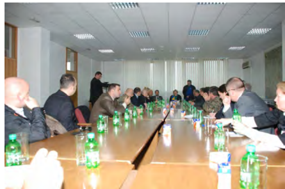
Visit to Regional Transition Centre in Rajlovac

During the visit, WG1 members were in position to examine existing infrastructure on-site and to exchange first-hand experience with the staff members responsible for the execution of support programmes in the Centre.