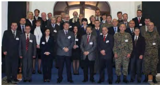
Workshop Participants - Group Photo, Army Club Sarajevo

With regard to this, one of the most important organizational principles when it comes to the development of efficient career transition support network is the regional approach principle. It has proved itself as the ultimate modern solution for the countries with transitional economies.