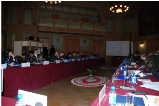
Workshop in Session, Army Club Conference Hall

The Workshop was conducted as a combination of individual presentations, and subject matter deliveries.