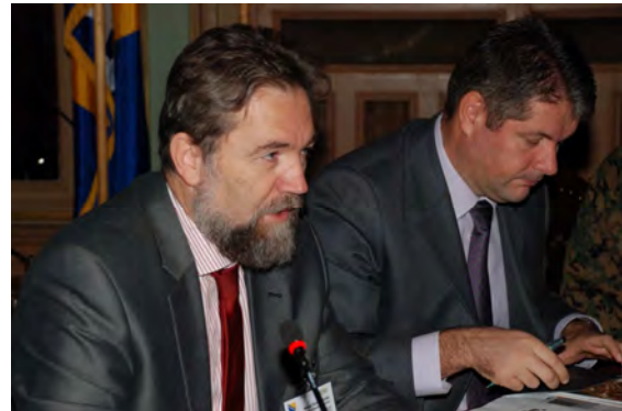
Workshop Opening, Army Club Hall

logistical support. In accordance with the mentioned in-country approach, host country's requirements were the priority for RACVIAC in developing Workshop programme, which contained the objectives defined jointly in advance.