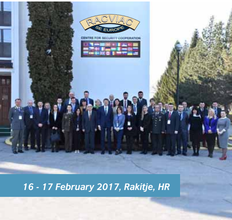
16 - 17 February 2017, Rakitje, HR

The OSCE Code of Conduct on Politico-Military Aspects of Security was adopted in 1994 and it presents one of the main OSCE mechanisms to address the global security challenges.