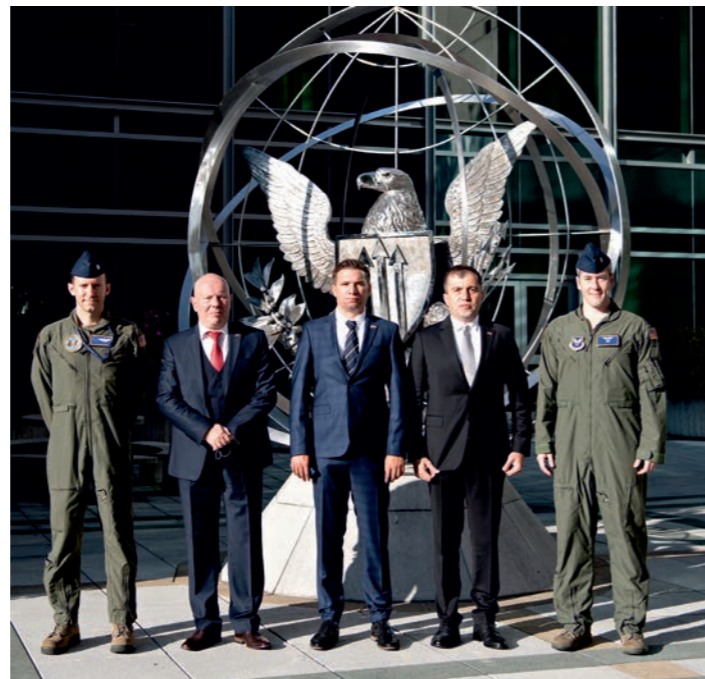
DTRA Hosts and RACVIAC Delegation