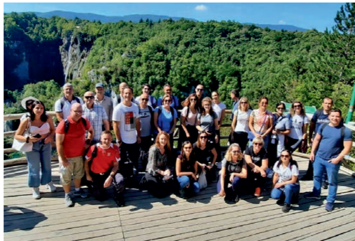
Group Photo - Field Trip to National Park "Plitvice Lakes"

The key event was the practical outdoor exercise on how to use role playing in gender integrated training, which was held during day six. This type of exercise facilitates an active understanding of the information and gives participants the opportunity to apply new skills and abilities. The simulation serves as a rehearsal on how to conduct future activities.