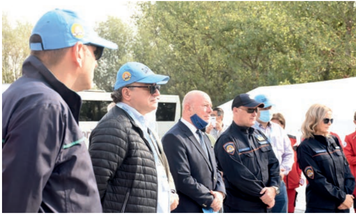
Demonstration Exercise, Rakitje Lakes

of operational forces and participants in the civil protection system. The Exercise was conducted by members of the Civil Protection Directorate, the Croatian Mountain Rescue Service, the Croatian Fire Brigade, the Croatian Institute of Emergency Medicine, the Croatian Red Cross and Rakitje Firefighters' Association, who all showed what the operational actions and procedures in such a situation are and displayed mutual cooperation, coordination and speed in exchange of relevant information.