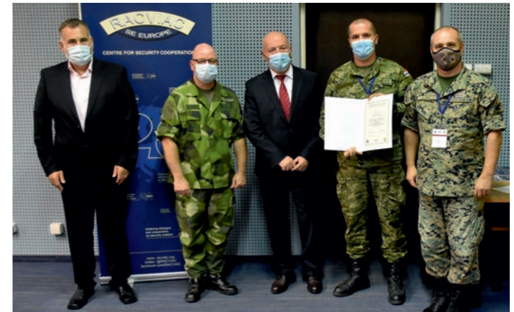
Graduation day, awarding of certificates