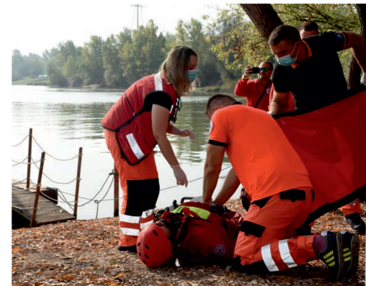
Demonstration Exercise, Rakitje Lakes

The second day was reserved for the Demonstration Exercise and was an opportunity for the participants of the Workshop to observe a Demonstration Exercise at Lake Rakitje. The Exercise was conducted by simulating a rupture of the embankment caused by a large water wave with the aim of showcasing and checking the training and readiness