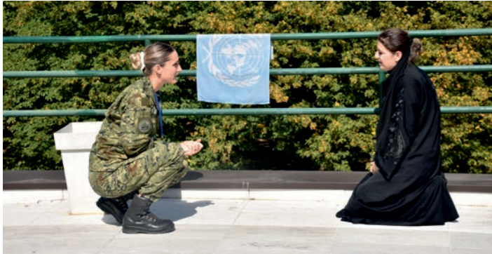
Practical Outdoor Exercise – Role Playing Training