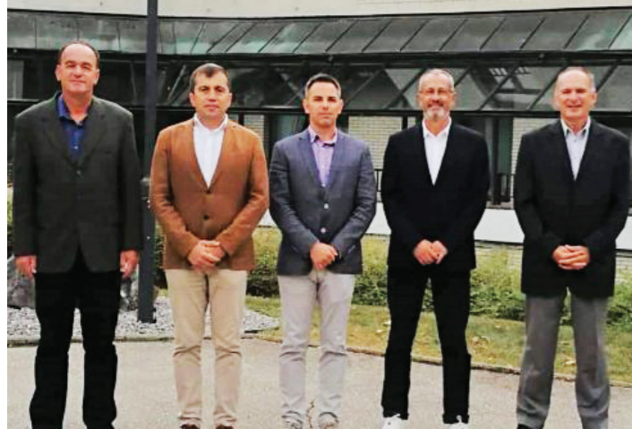
VERC Hosts and RACVIAC Delegation