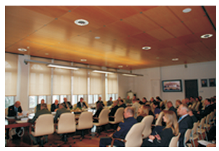
33 participants from 11 countries and participants attended the seminar

Croatian Defence Academy, University of Zagreb and the University of Defence in Belgrade.