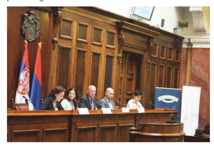
Conference opening - Welcome Addresses (Starting from left)

The Conference itself was designed around four panel sessions chaired in turns by the leading representatives of the three partner organizations.