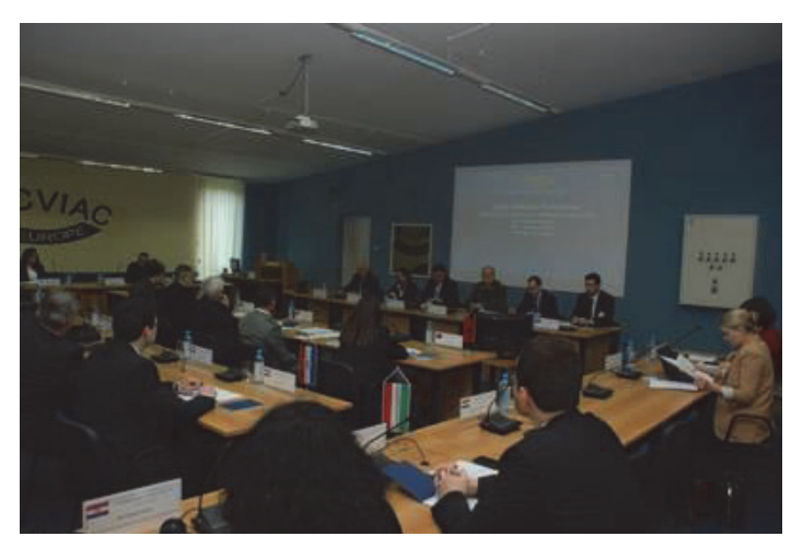
The seminar brought together a total of 32 participants from RACVIAC Members, Associate members and experts in the field of Private security