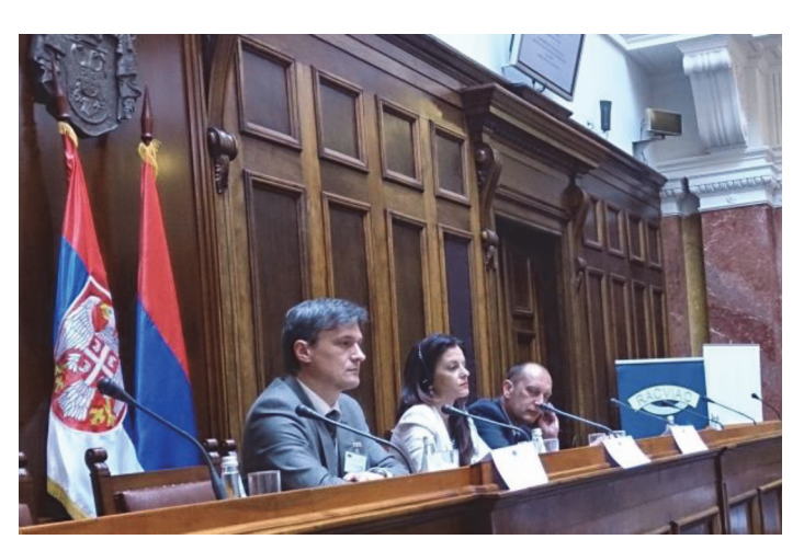
Subject Mater Expert Presentations - Panel II (Starting from left)

Disasters have Become Militarized in Modern Times?"