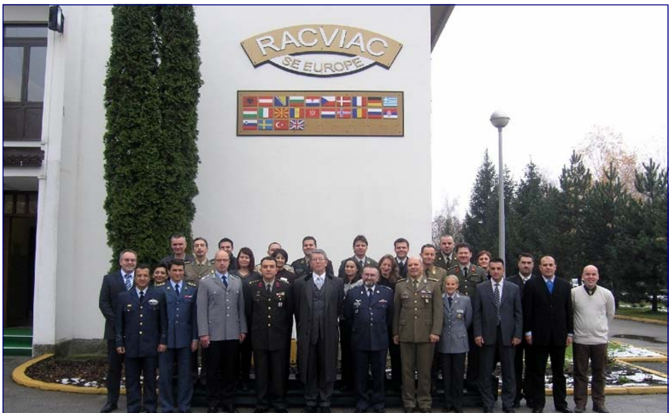
RACVIAC STAFF MEMBERS— November 2007