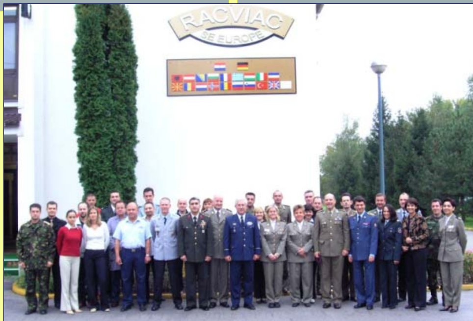
RACVIAC's PERMANENT STAFF, September 2005.

* (AL, AT, BA, BG, DE, FR, GB, GR, HR, HU, IT, MD, MK, NL, NO, RO, RU, SI, S&M, TR )