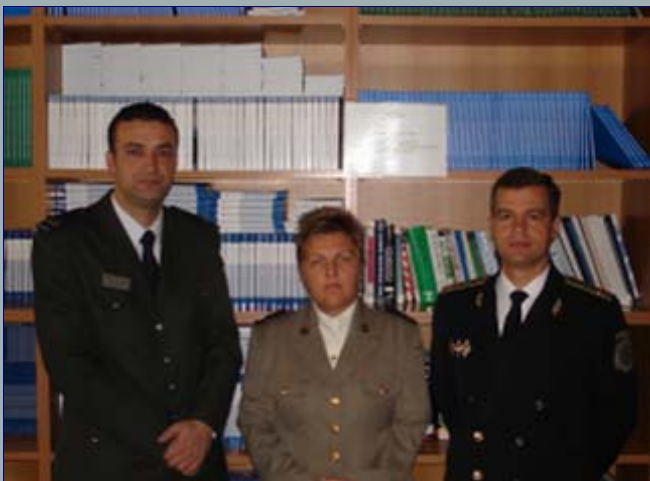
NEW DEFENCE CONVERSION CELL

The Multinational Advisory Group (MAG), as the decision-making body of RACVIAC, decided to respond positively to the Bucharest Declaration of the Ministers of Defense of SEECP countries by expanding RACVIAC's scope activities and work into the field of Defence Conversion.